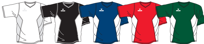
6 white 138 black/white 179 navy/white 129 red/white 92 forest/white

Model: 78227 Material: 100% Breathe Comfort Polyester Sizes: YS / YM / YL / S / M / L / XL MSRP: $18.00