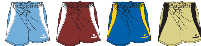
373 sky blue/white 142 maroon/white 289 royal/gold 556 vegas gold/black