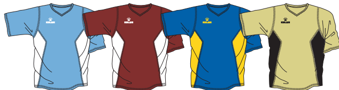
373 sky blue/white 142 maroon/white 289 royal/gold 556 vegas gold/black