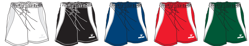
6 white 138 black/white 179 navy/white 129 red/white 92 forest/white

Model: 78228 Material: 100% Breathe Comfort Polyester Sizes: YS / YM / YL / S / M / L / XL MSRP: $12.00