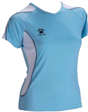
373 sky blue/white