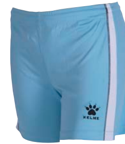
373 sky blue/white