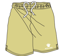
555 vegas gold