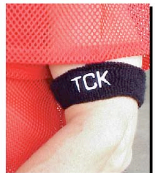
Shown with optional embroidery

Packaged individually Minimum order 12 each